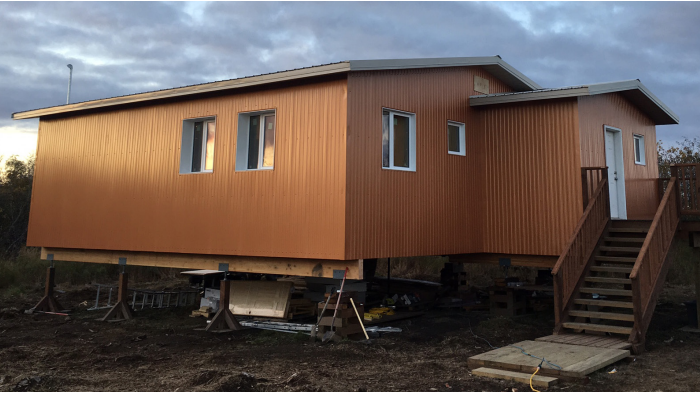
The latest BrHEAThe system is heating and ventilating a home in Oscarville, Alaska after its installation in 2017. It is similar to the BrHEAThe system in the Birch house but features more advanced controls.