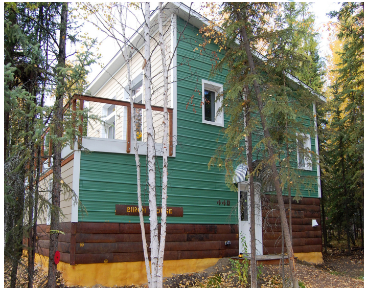
The Birch house at the University of Alaska Fairbanks Sustainable Village is 1,500 ft 2 and houses four students in separate bedrooms downstairs. The upstairs is an open kitchen and living space.

Finally, interviewees suggested improving the education