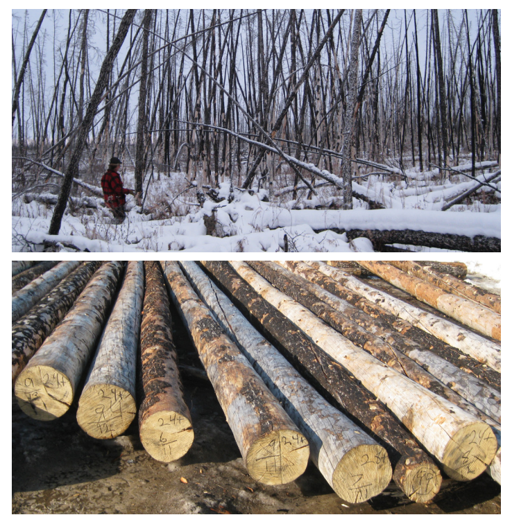
Village residents hand-picked the logs from standing dead wood forests and allowed them to season for three years before construction.

Logs take several years to season after being cut down. To account for this, villagers harvested timber from the standing dead wood around Venetie—much drier than average wood. During construction, builders provided space within the structure to allow logs to dry and settle over time. On top of the steel stud wall is a track with a slip joint that supports the roof and prevents it from resting on the logs. Extra gaps were also left around door and window frames to allow logs to settle as they dry.