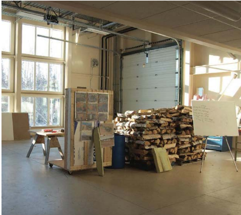
Top Rainwater is collected from the roof and used for the sprinkler system, the toilets and the sewage treatment plant. CCHRC collects about 15,000 gallons of rainwater per year.